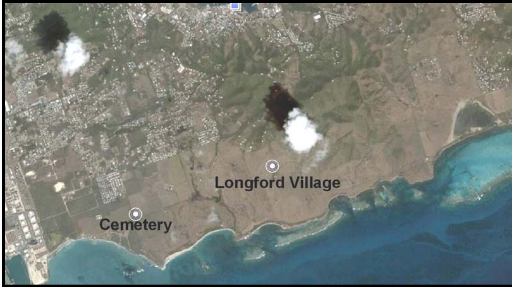
Figure 3: Satellite image (Google Earth Pro) showing the location of the cemetery and the Longford village structures