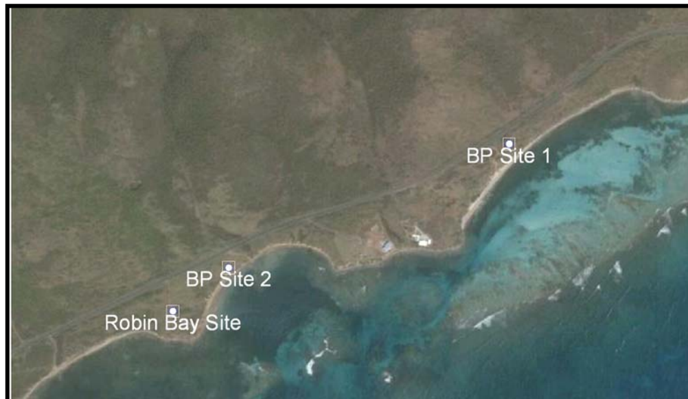
Figure 4: Satellite image (Google Earth Pro) showing the location of the Pre-Columbian sites